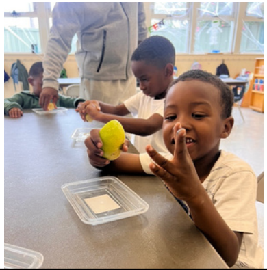
INVISIBLE INK WITH LEMONS