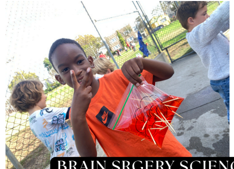
BRAIN SRGERY SCIENCE