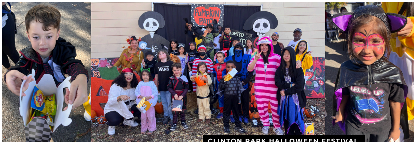
CLINTON PARK HALLOWEEN FESTIVAL