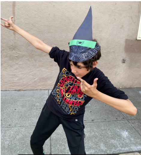
WITCH HAT CRAFTS