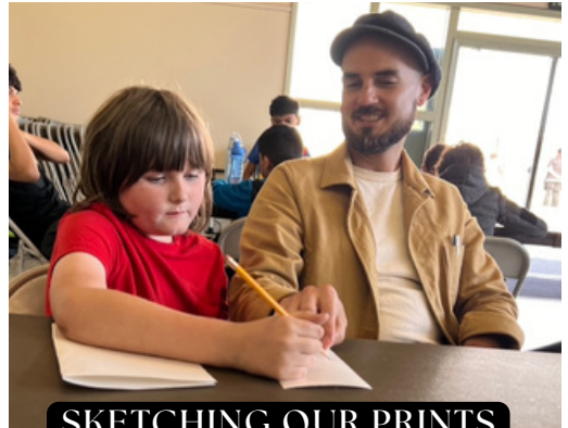
SKETCHING OUR PRINTS