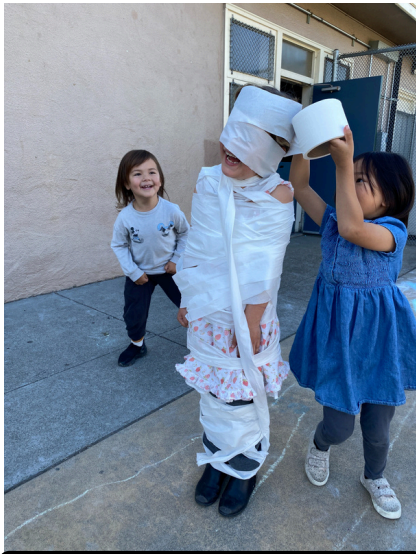
TOILET PAPER MUMMIES