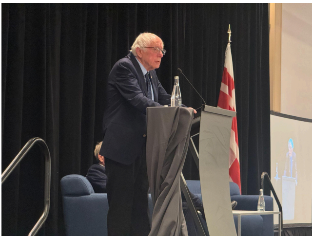
Senator Bernie Sanders, NCAF Legislative Breakfast 3/18