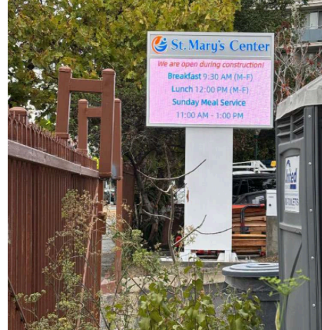
St. Mary's Center, Oakland. Received $40,000. Provided housing services for 50 senior adults. Concerned about federal funding uncertainty.