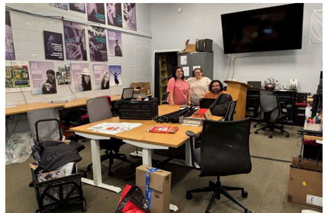
Love Never Fails, Hayward. Received $25,000, Served 25 students by providing job training, housing, and trauma informed care to victims of human trafficking