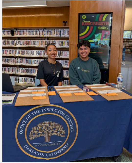
Main Library Oakland, CA July 2, 2025