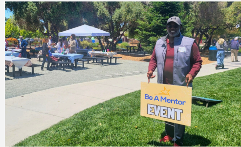
Be-A-Mentor Oakland, CA July 19, 2025