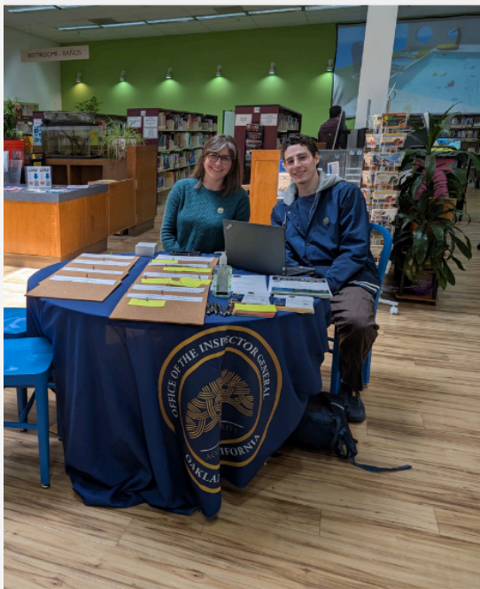
Eastmont Library Oakland, CA June 25, 2025