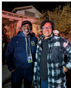
Melrose Holiday Parade Oakland, CA December 8, 2025

Would you like the OIG to speak at your next meeting? Please email Monica Pelayo Lock at mpelayolock@oaklandca.gov to arrange a presentation.