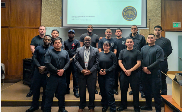
195 th Academy Transition Training Oakland, CA January 22, 2026