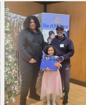
Be-a-Mentor Oakland, CA December 20, 2025