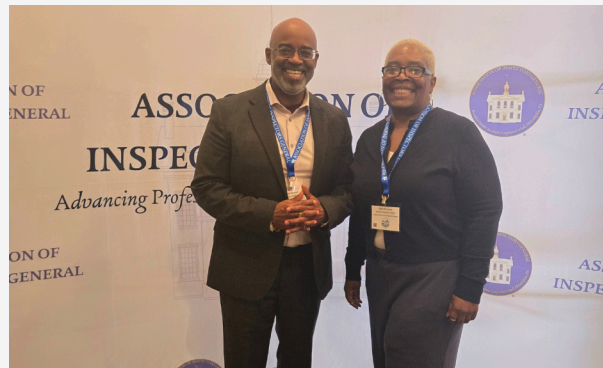
AIG Conference San Diego, CA November 11-13, 2025