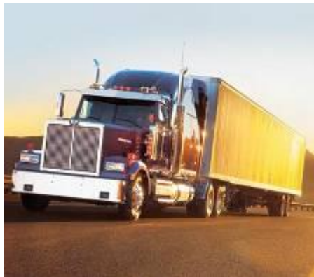
Highway TL and LTL;