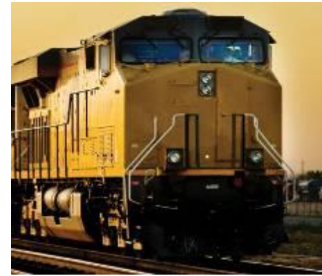
Domestic & International Intermodal