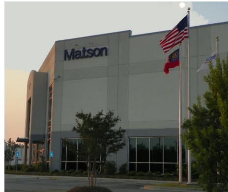
Warehousing & Distribution