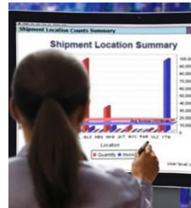
Supply Chain Services