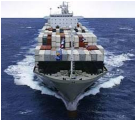
Eastbound China Express Service