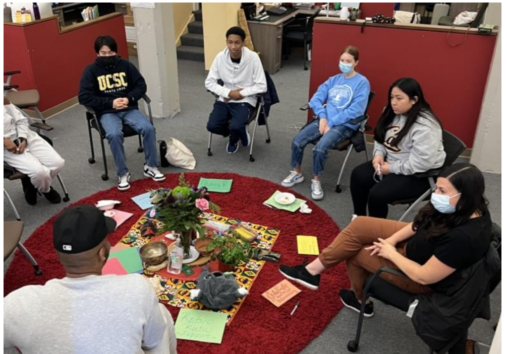
Photo from our Circle Keeper training with Restorative Justice for Oakland Youth Photo taken at the RJOY office on December 12, 2022.

We are excited to continue to use this tool to build the relationships and skills among our youth commissioners to utilize in our internal operations as well as how we approach solving complex social issues.