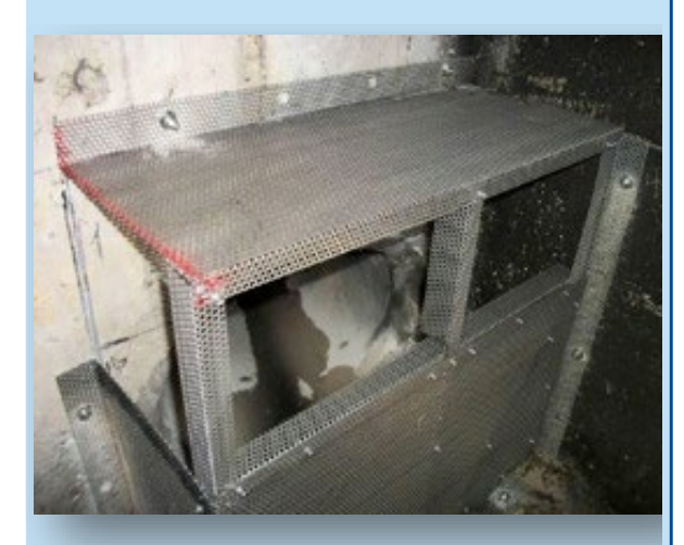
Inlet Based Full Trash Capture Device

Best Practice: Perform routine pavement maintenance to avoid major reconstruction.