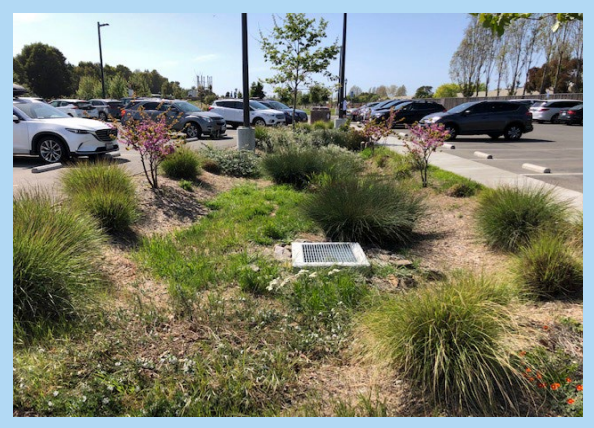
Bioretention Area in the City of Alameda