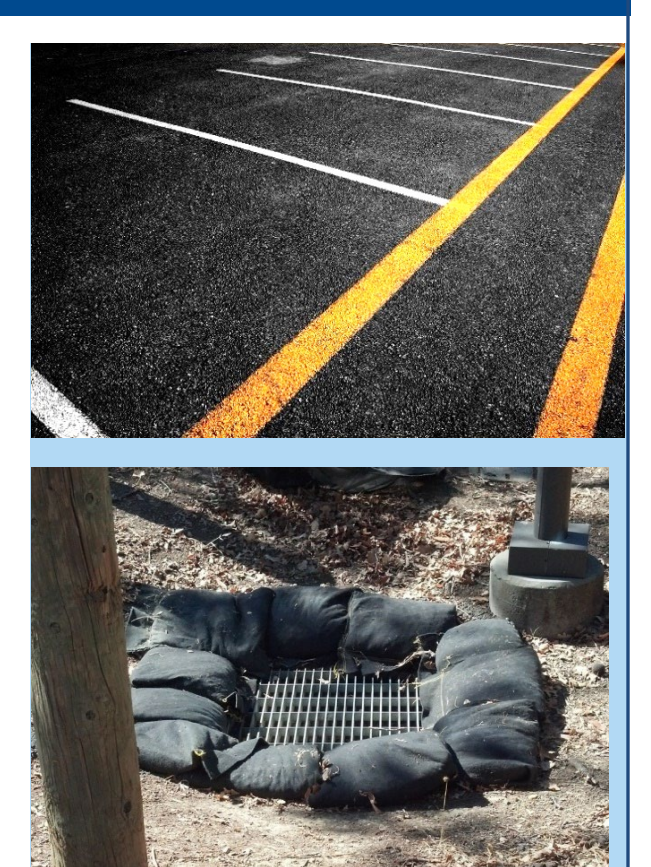
Construction Phase Storm Drain Protection

Protecting Alameda County Creeks, Wetlands & the Bay cleanwaterprogram.org