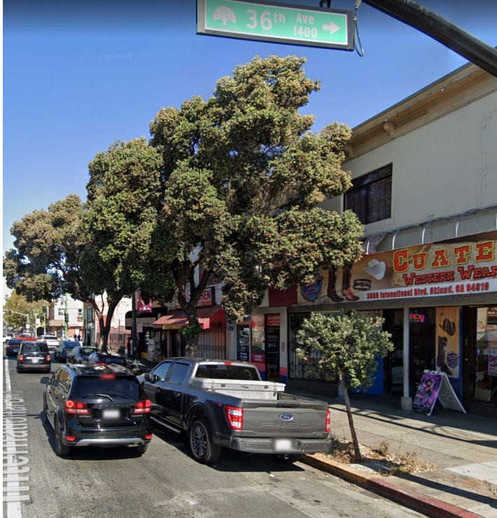
Tree canopy maintained above storefront