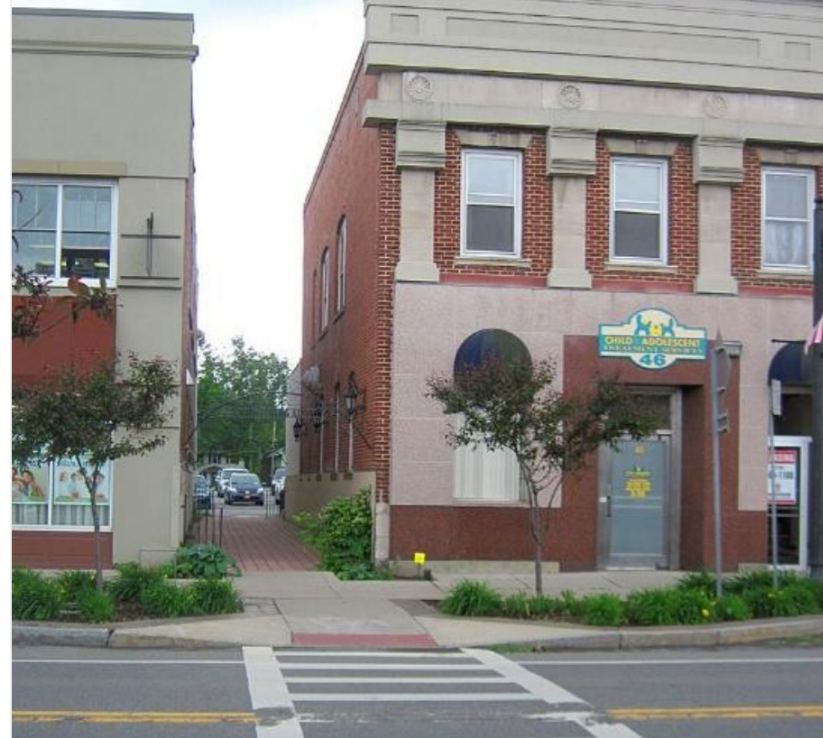
Clearly marked transitional zones