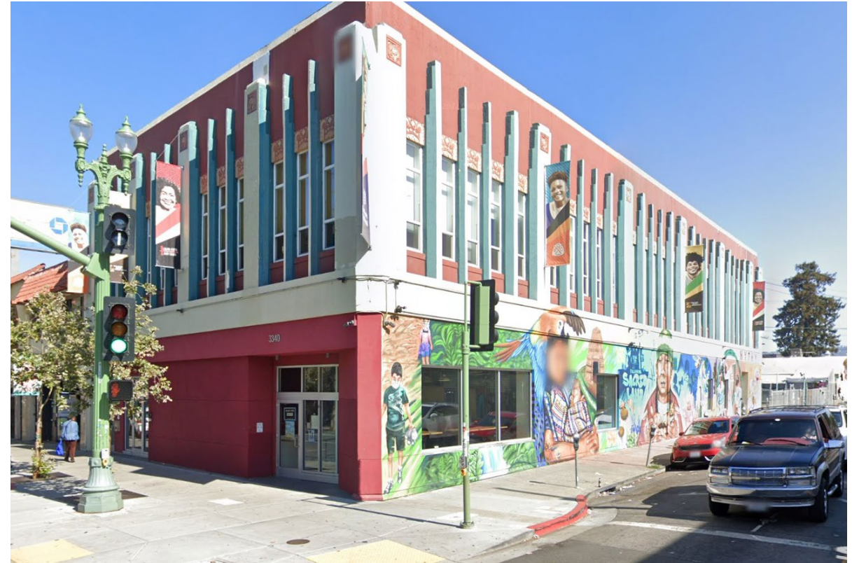
Restore Oakland on International Boulevard