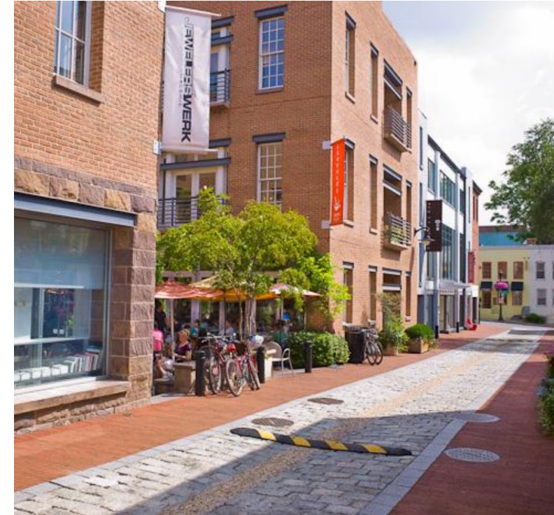
Activated alleyways or recesses