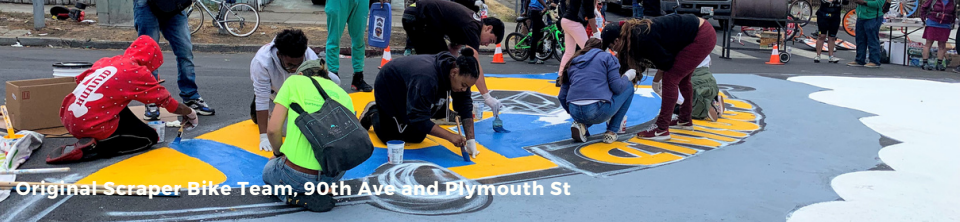
Original Scraper Bike Team, 90th Ave and Plymouth St