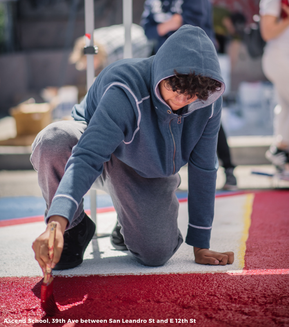
Ascend School, 39th Ave between San Leandro St and E 12th St

https://www.oaklandca.gov/projects/paint-the-town paintthetown@oaklandca.gov (510) 238-6640