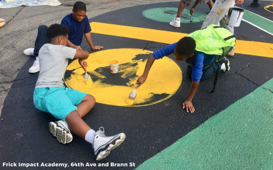
Frick Impact Academy, 64th Ave and Brann St