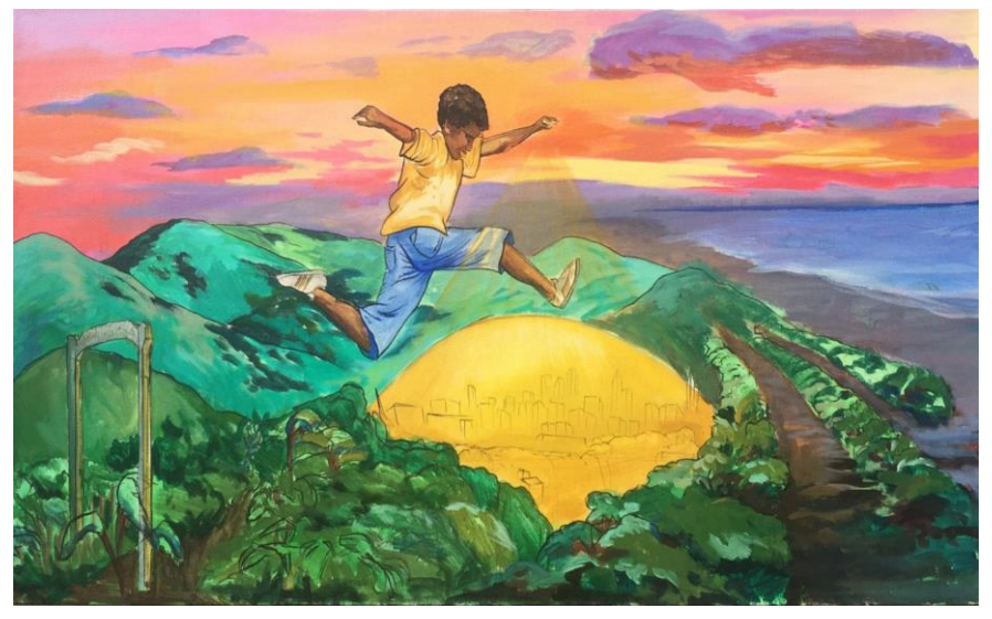
Oakland Super Heroes Mural Project Mural No 4 for West Street. by Attitudinal Healing Connection (AHC) – Organization Assistance Recipient