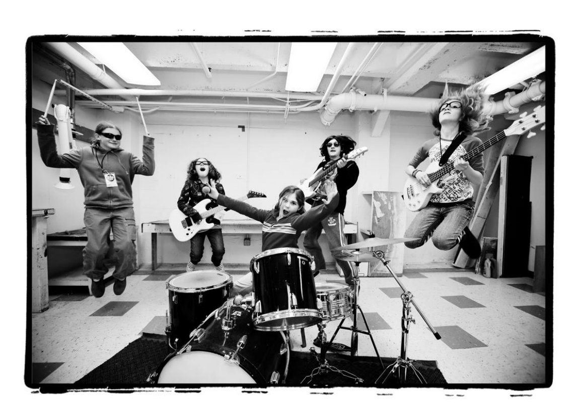
Bay Area Girls Rock Camp, Organization Project Grant Recipient