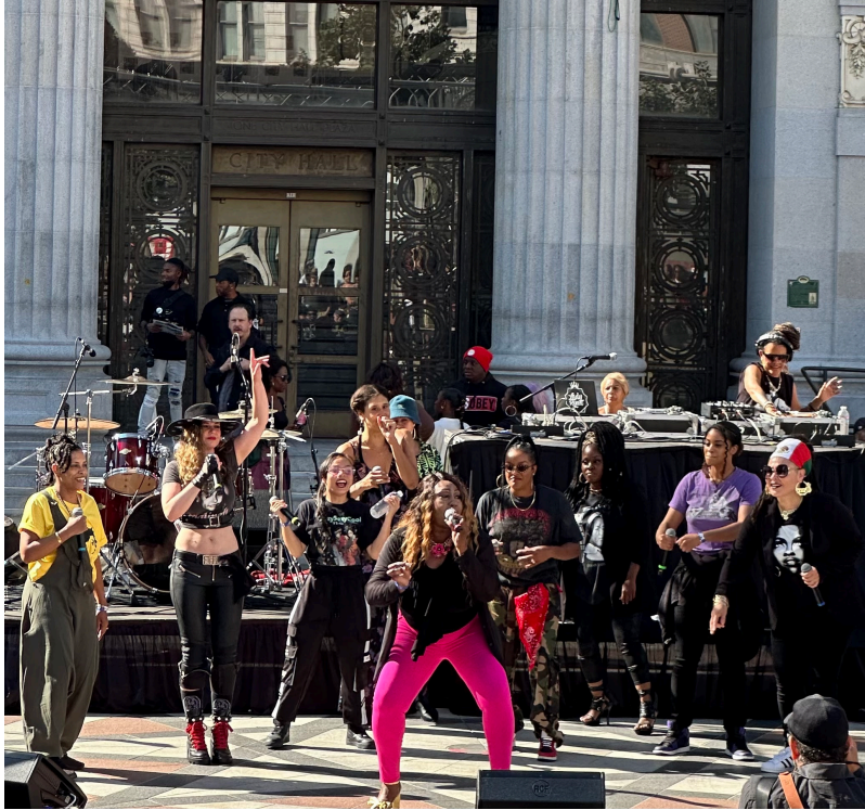
Let's do more of this! Women in Hip Hop Revue at September 17th Art & Soul Festival, City Hall Plaza

Last Thursday, September 14th, Mayor Thao and City leaders launched Activate Oakland in partnership with Visit Oakland to increase foot traffic in Oakland's commercial corridors, support Oakland's small businesses, and showcase Oakland's arts and culture community. The program provides up to $10,000 to assist with funding events and activations of all sizes from block parties to festivals. Apply by October 12th for eligible projects including: free exercise/dance classes, fashion shows, paint parties, movie nights, kids' story time, games or activities, outdoor karaoke, pickleball lessons and tournaments, block parties, music, art, spoken word performances, yoga, cooking classes, art-making activities, district walking tours, poetry readings, pop-up retail shops, and more. Learn more at Activate Oakland .