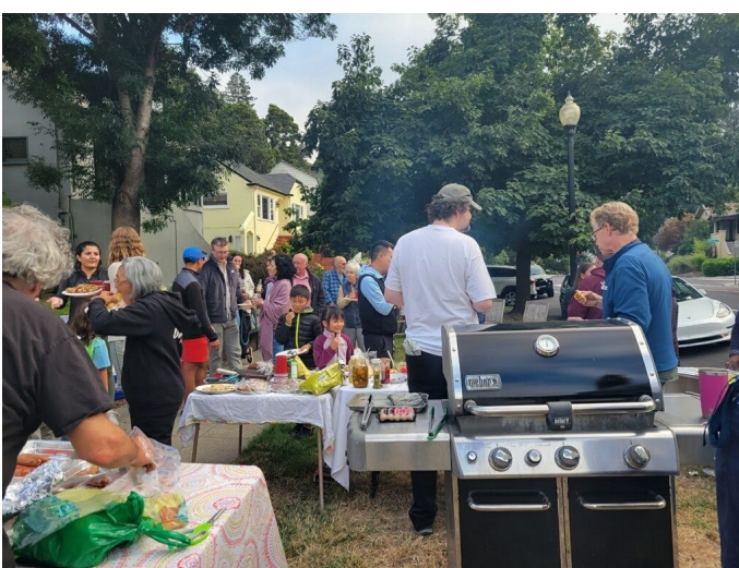
This year's National Night Out was a heart-filled experience for staff and volunteers who attended events to support programming by doing outreach for Neighborhood Councils. The District 2 Staff were able to attend a range of events, from living room sit downs to block parties filling the streets, and at each one, the sense of community was palpable.

"Residents are getting used to NNO, and are starting to ask for us to do this kind of programming every month. It's a lot of planning, but seeing the families come out of their homes is really great." Said a San Antonio Neighborhood Council Member.